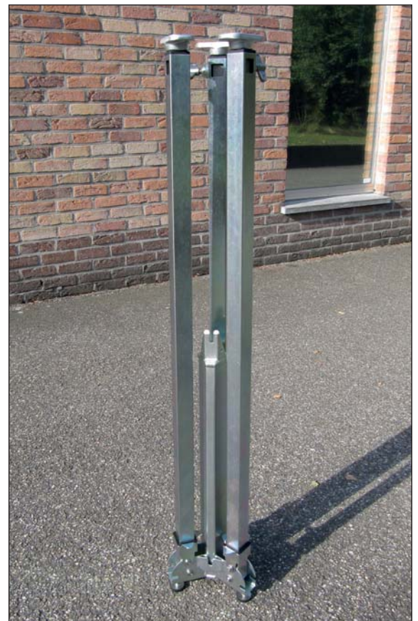
Vertical storage position