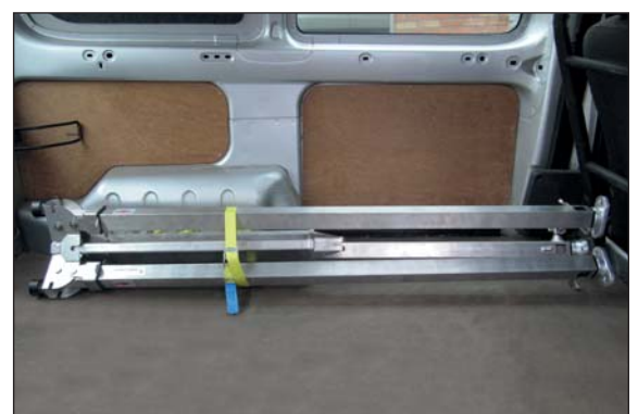
Horizontal storage position